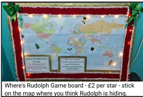
Where's Rudolph Game board - £2 per star - stick on the map where you think Rudolph is hiding.

PLEASE COME ALONG TO SUPPORT OUR SCHOOL!