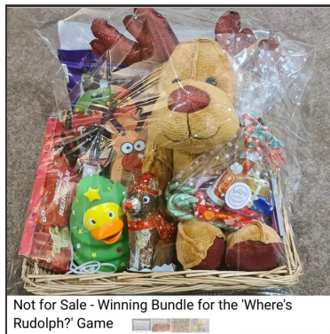
Not for Sale - Winning Bundle for the Where's Rudolph? Game