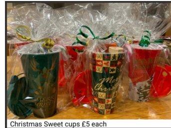
Christmas Sweet cups £5 each