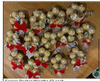
Ferrero Rocher Wreaths £3 each