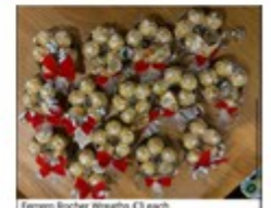
Famero Rocher Wreaths £3 each

The PTA are very proud to announce that the total profit made from the Christmas Raffle and Christmas Market sales was a staggering £1024.69!