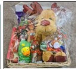
Not for Sale - Winning Bundle for the Where's Rudolph? Game