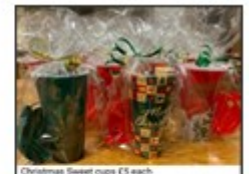
Christmas Sweet cups £3 each