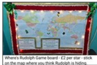
Where's Rudolph Game board - £2 per star - stick on the map where you think Rudolph is hiding.